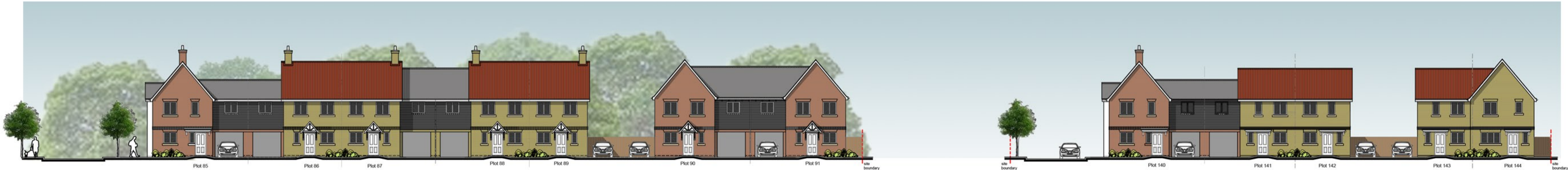
Street Scene F-F