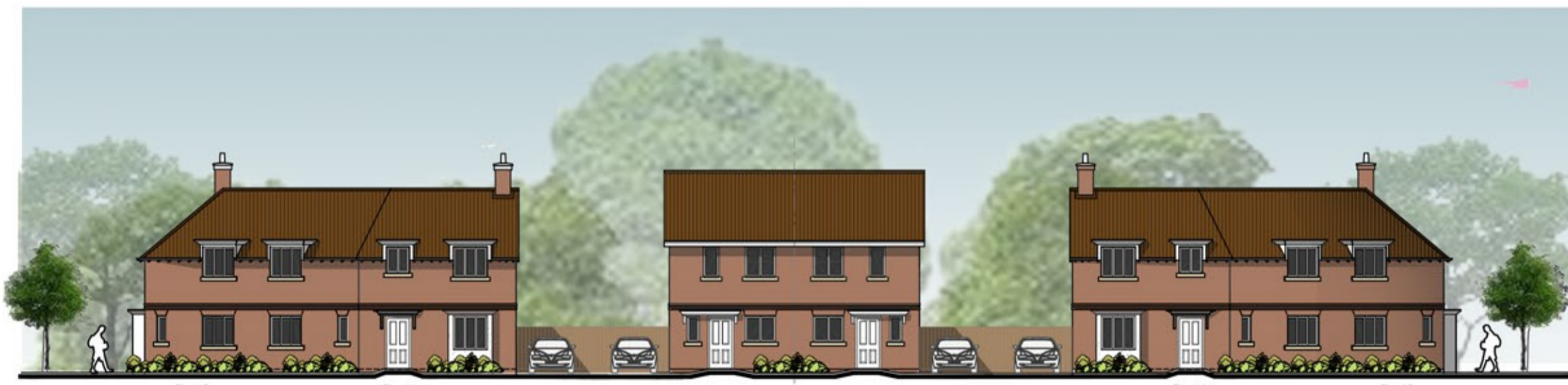
Street Scene I-I