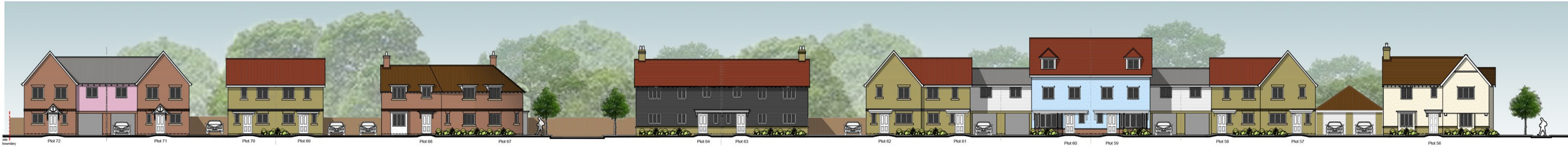
Street Scene E-E