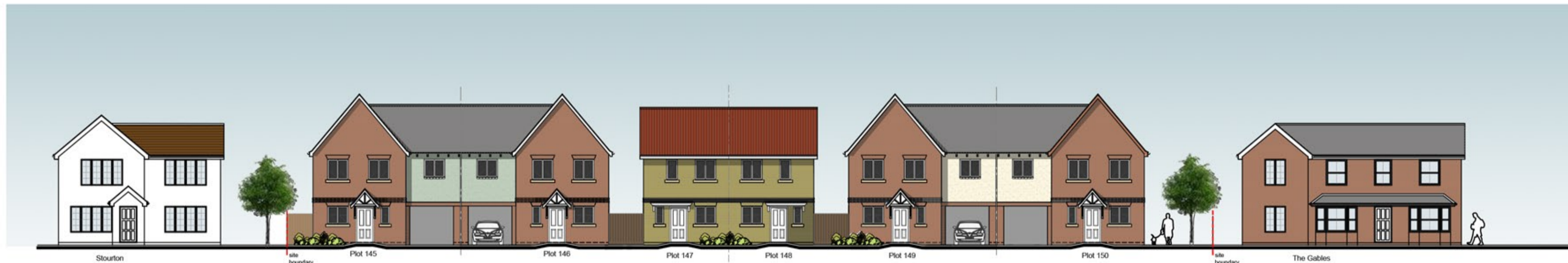
Street Scene H-H